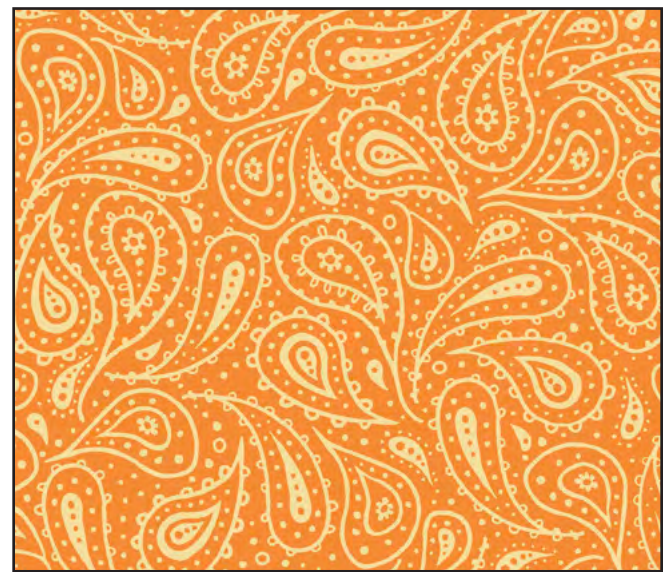
27859 O (ORANGE) PAISLEY 0 16542 15885 7