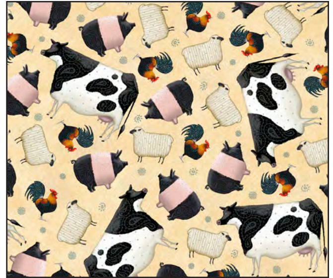
27858 E (CREAM) TOSSED FARM ANIMALS 0 16542 15861 1