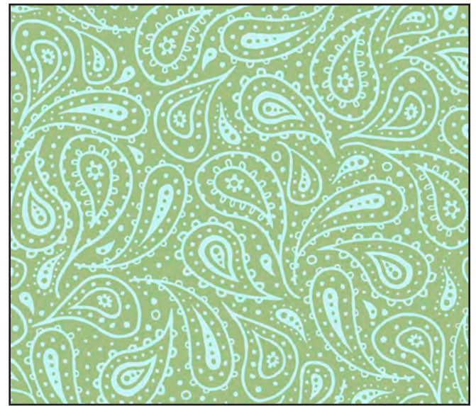
27859 H (LIGHT GREEN) PAISLEY 0 16542 15873 4