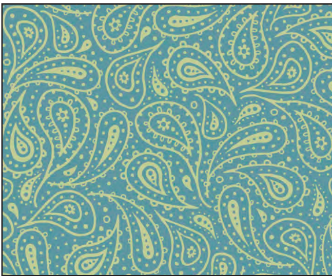
27859 Q (TEAL) PAISLEY 0 16542 15877 2