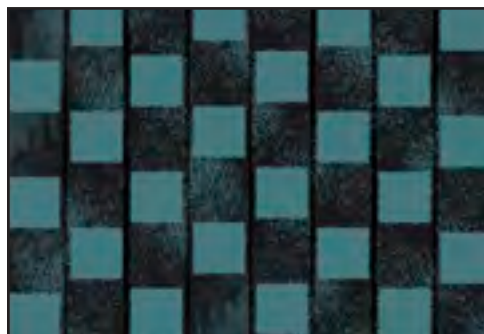
27860 Q (TEAL) CHECK 0 16542 15894 9