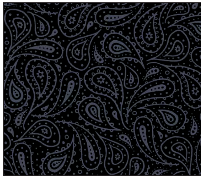
27859 J (BLACK) PAISLEY 0 16542 15881 9