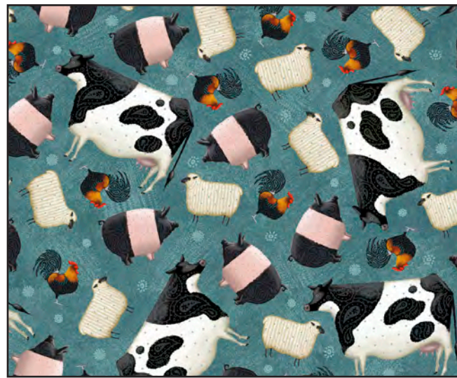
27858 Q (TEAL) TOSSED FARM ANIMALS 0 16542 15869 7