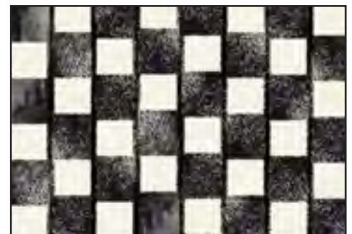
27860 Z (WHITE) CHECK 0 16542 15902 1