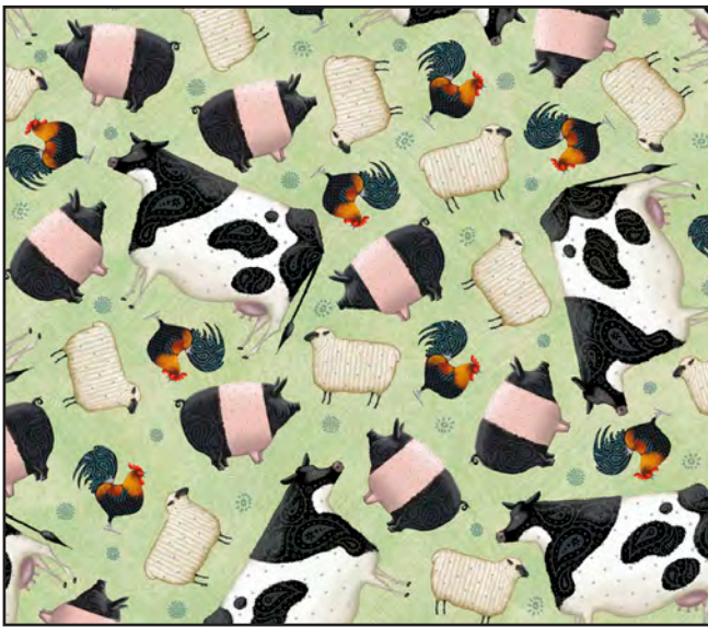
27858 H (LT. GREEN) TOSSED FARM ANIMALS 0 16542 15865 9