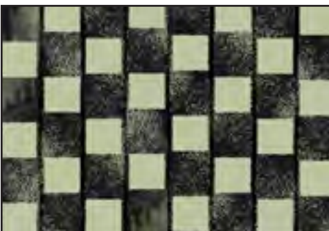
27860 H (LT. GREEN) CHECK 0 16542 15890 1