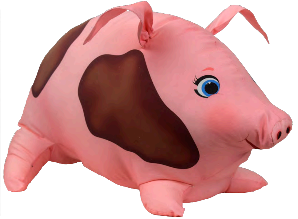
Ellie May Pig Finished size approximately 17" x 8" w x 10" h