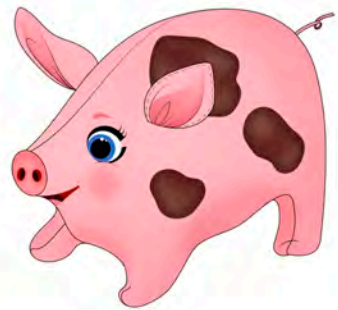
28128 P (PINK) ELLIE MAY PIG STUFFABLE PANEL (36")