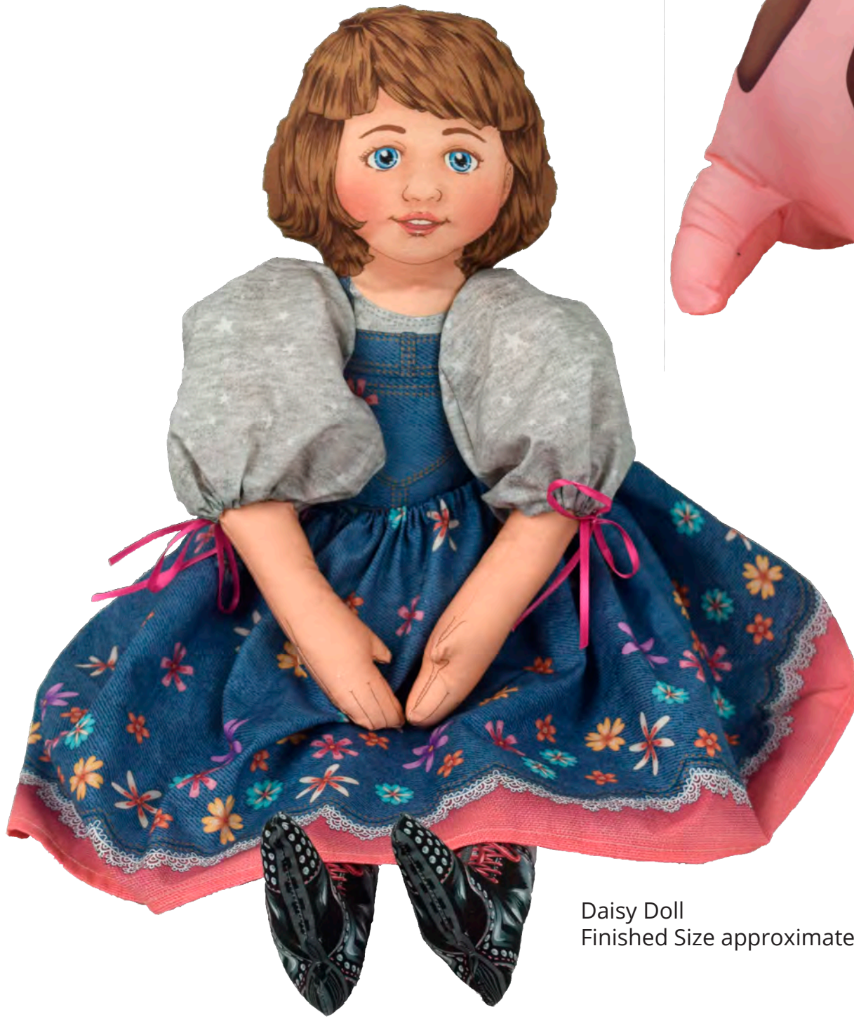
Daisy Doll Finished Size approximately 24" h