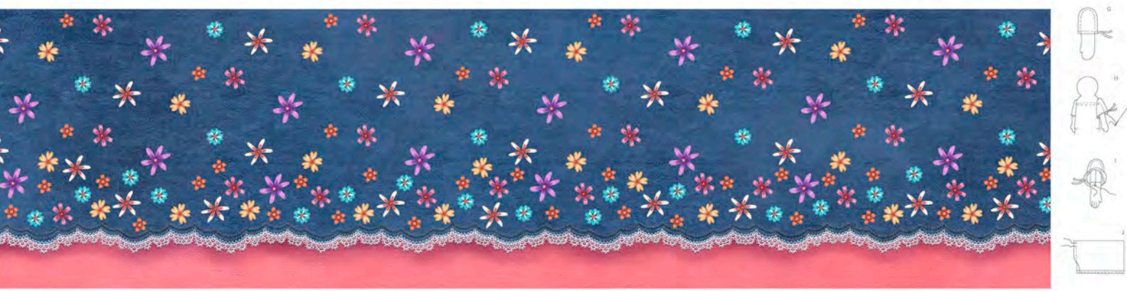
28129 W (DENIM) DAISY DOLL CRAFT PANEL (36")