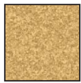
23528-AE Color Blends