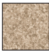
23528-AK Color Blends