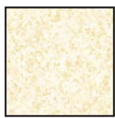
23528-EA Color Blends