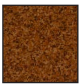
23528-AJ Color Blends