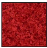
23528-RO Color Blends II