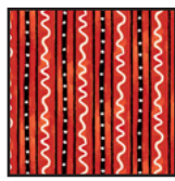
26863-R also binding