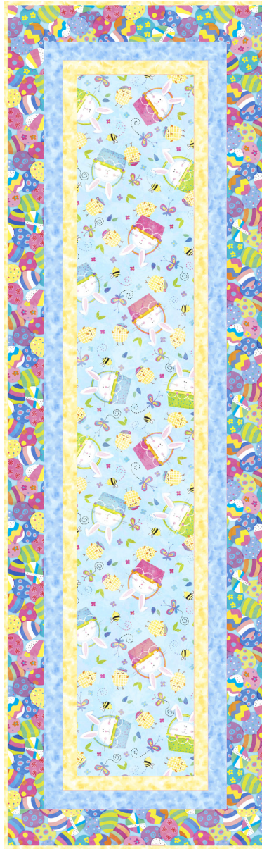
Finished Size: 18" x 58"