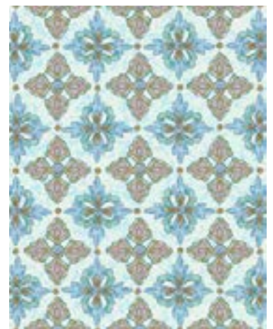
27754 B (Lt. Blue) Foulard 0 16542 14453 9