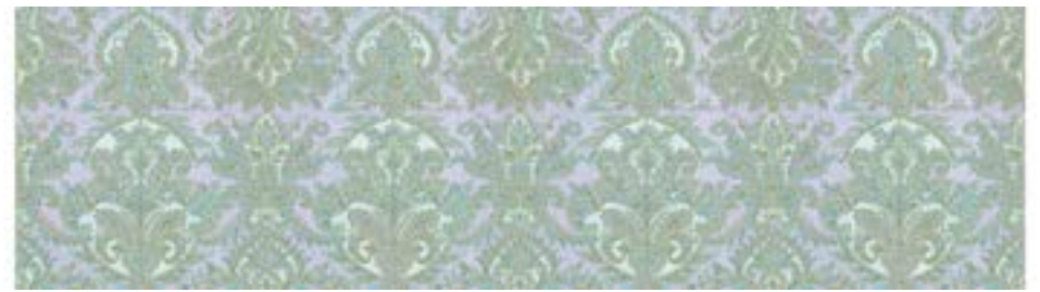
27751 L (repeated from selvedge to selvedge)