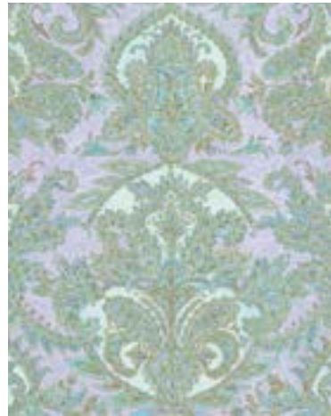
27751 L (Lilac) Medallion Allover 0 16542 14430 0