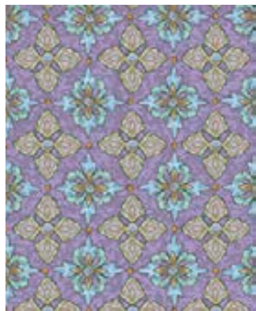
27754 L (Lilac) Foulard 0 16542 14457 7