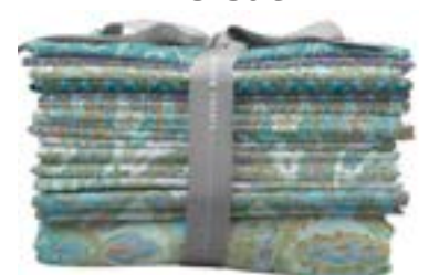
FATQUAR VERSAI 3PACKX (13 Fat Quarters per bundle includes 2/3 yard panel)