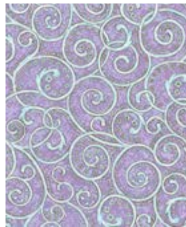
27755 L (Lilac) Scroll 0 16542 14469 0