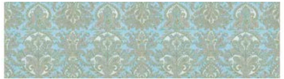
27751 B (repeated from selvedge to selvedge)