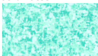
23528 QZ (Seafoam) Color Blends 0 16542 49857 1