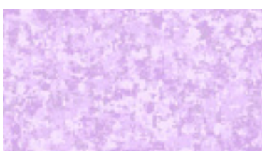
23528 LE (Iris) Color Blends 0 16542 49839 7