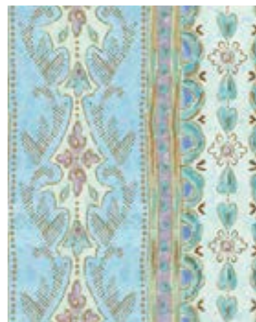
27753 B (Blue) Decorative Stripe 0 16542 14449 2