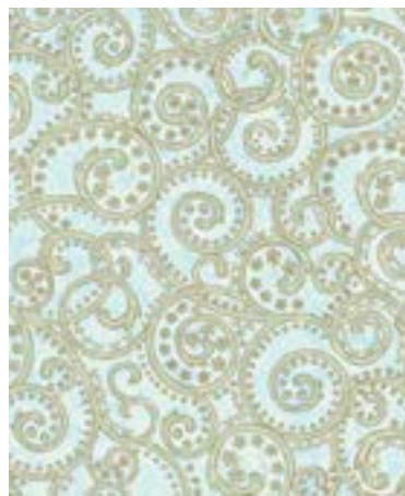
27755 B (Lt. Blue) Scroll 0 16542 14465 2