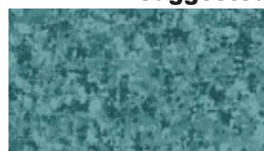
23528 QK (Slate Blue) Color Blends 0 16542 49856 4