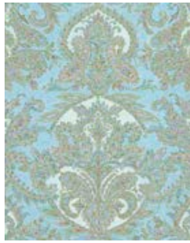
27751 B (Blue) Medallion Allover 0 16542 14426 3