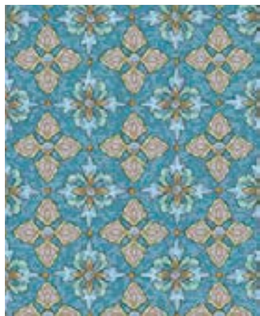
27754 W (Denim) Foulard 0 16542 14461 4