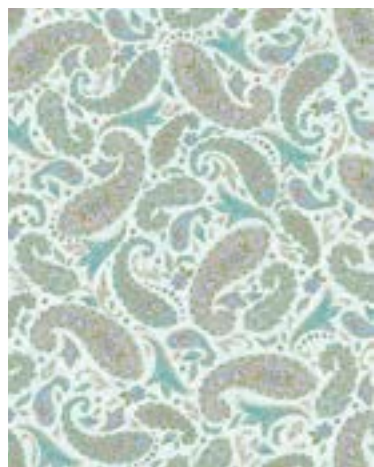
27752 B (Lt. Blue) Paisley 0 16542 14434 8