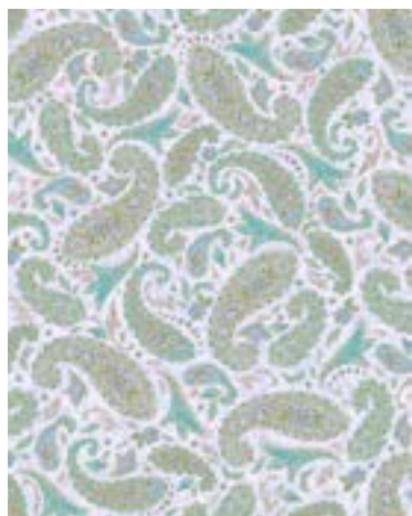
27752 L (Lt. Lilac) Paisley 0 16542 14441 6