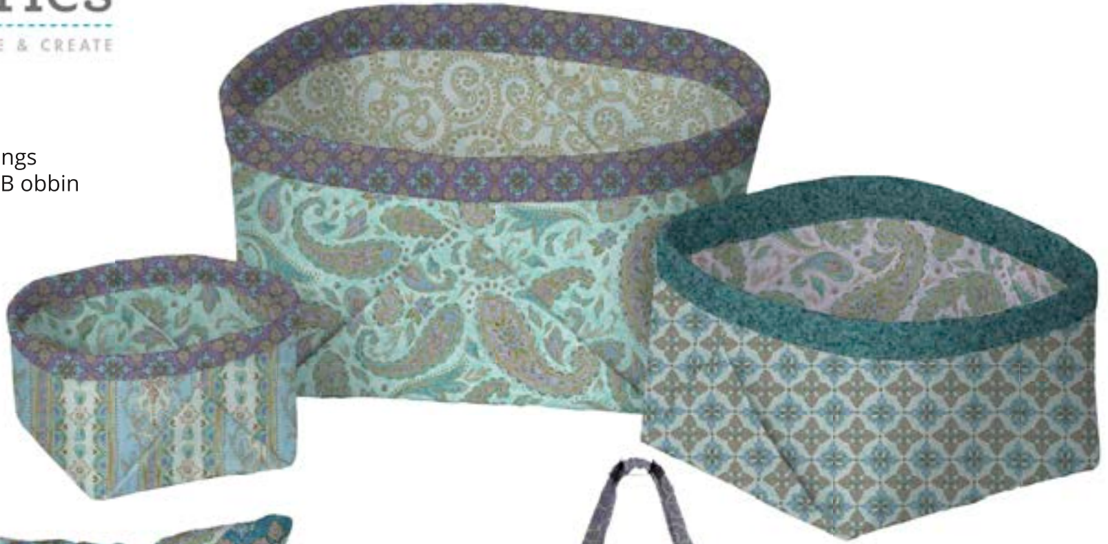
Pattern: Nestlings by Around TheB obbin