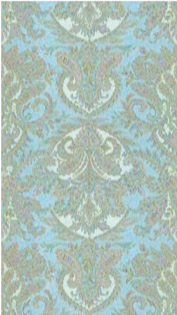
27750 B (Blue) Medallion Panel (24") 0 16542 14422 5