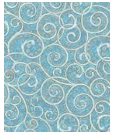
27755 W (Chambray) Scroll 0 16542 14473 7