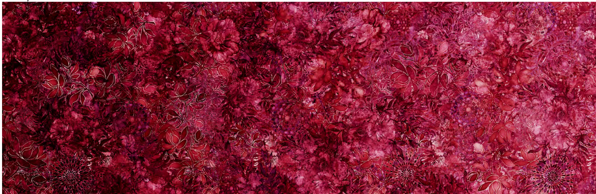
Cap 1 WARM 14 Color Combinations M4048 WARM

Full repeat measure 36" x 43" and has an ombre effect as shown below