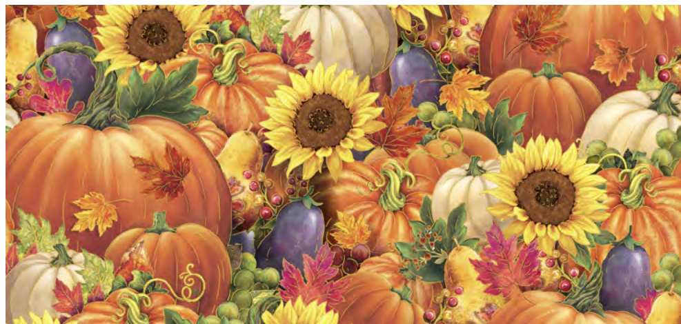
28969 O Pumpkins & Sunflowers (12")