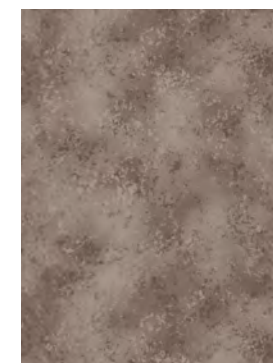
27935 AK Rapture