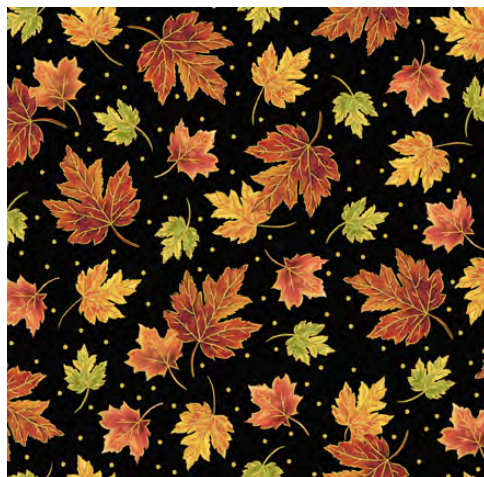
28971 J Leaves (6")