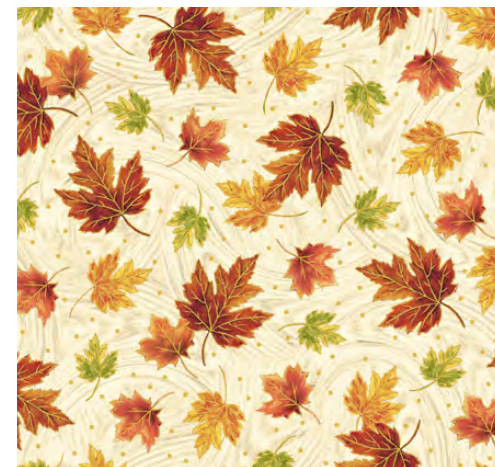
28971 E Leaves (6")