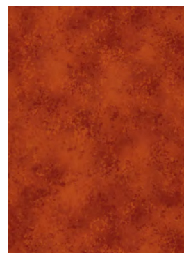
27935 T Rapture