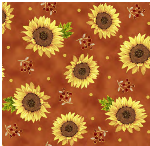
28970 O Sunflowers (6")