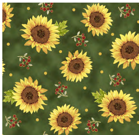
28970 G Sunflowers (6")