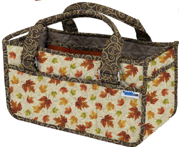
byAnnie.com Pattern: Catch All Caddy

#PBA225, CATCH ALL CADDY 2.0 PATTRN FORSALE PATTRN 8002B