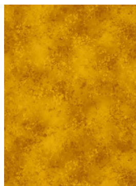
27935 SA Rapture