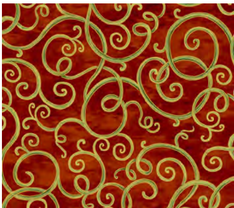
28972 T Scroll (4")