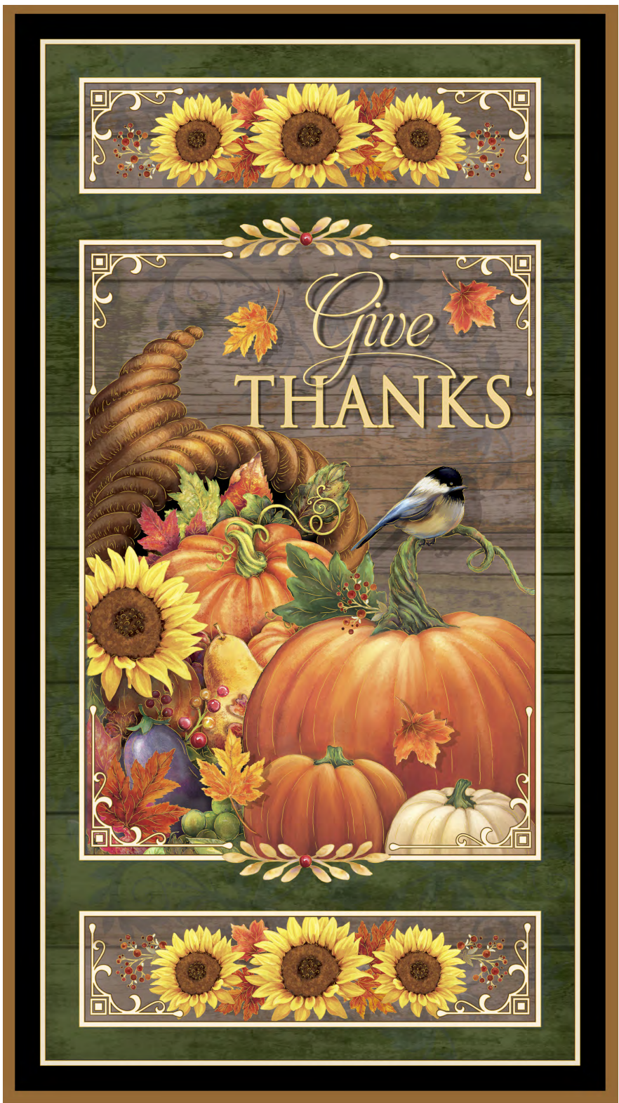
28968 X Give Thanks Harvest Panel (24")