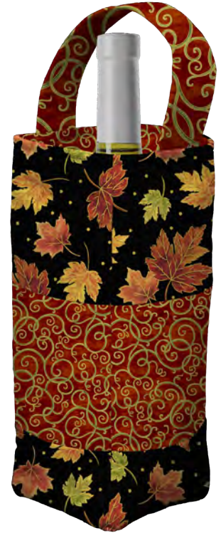
FREE QT Pattern: Wine Tote