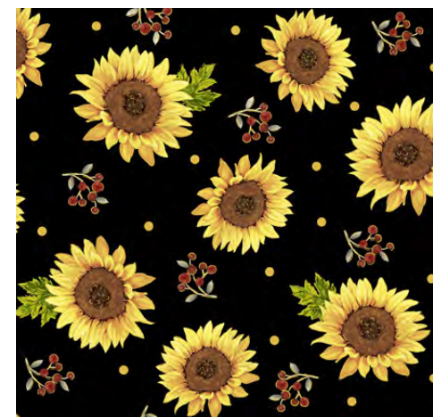
28970 J Sunflowers (6")