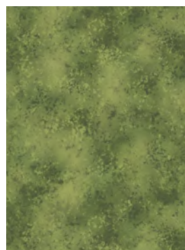
27935 HS Rapture