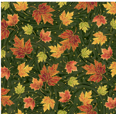
28971 G Leaves (6")