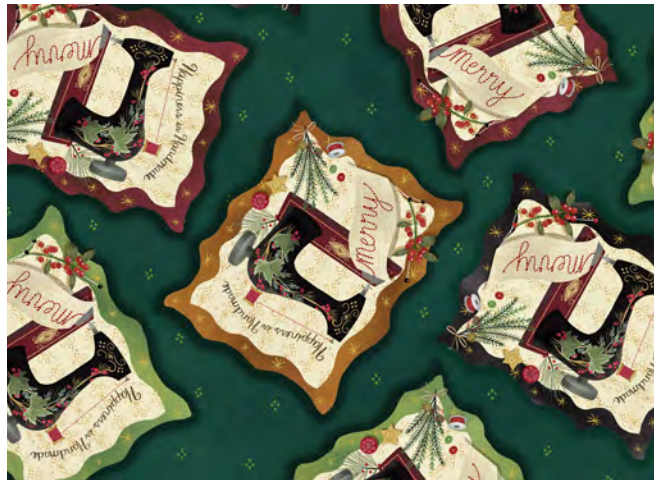
28907 F Sewing Machine Patches (24")