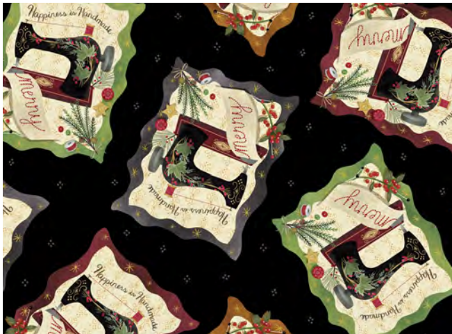
28907 J Sewing Machine Patches (24")