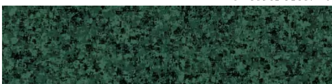
23528 FQ Color Blends II