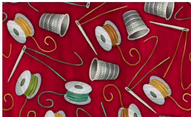
28910 R Thimbles (4.8")