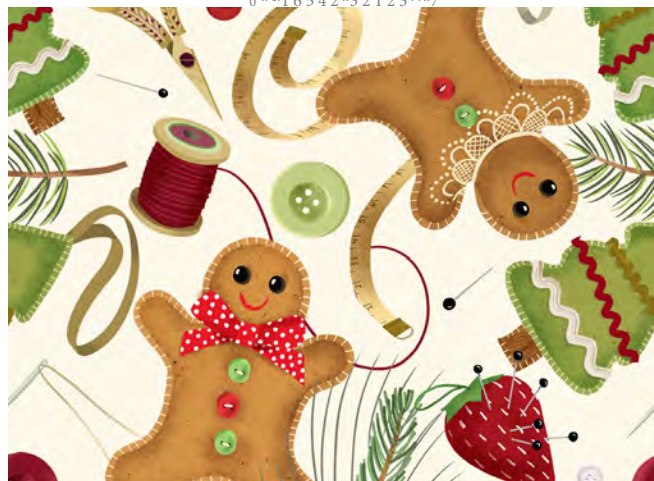
28908 E Sewing & Christmas Toss (6")