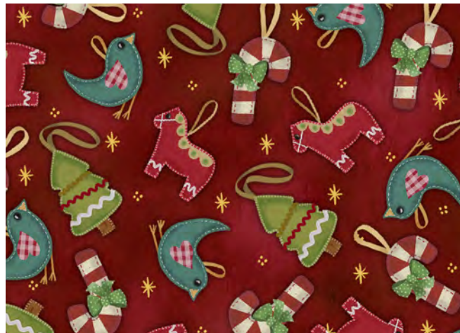
28909 M Ornaments (8")