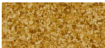
23528 SU Color Blends II