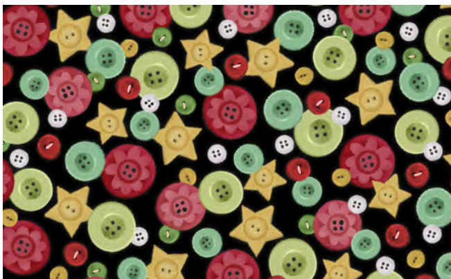
28911 J Buttons (4")