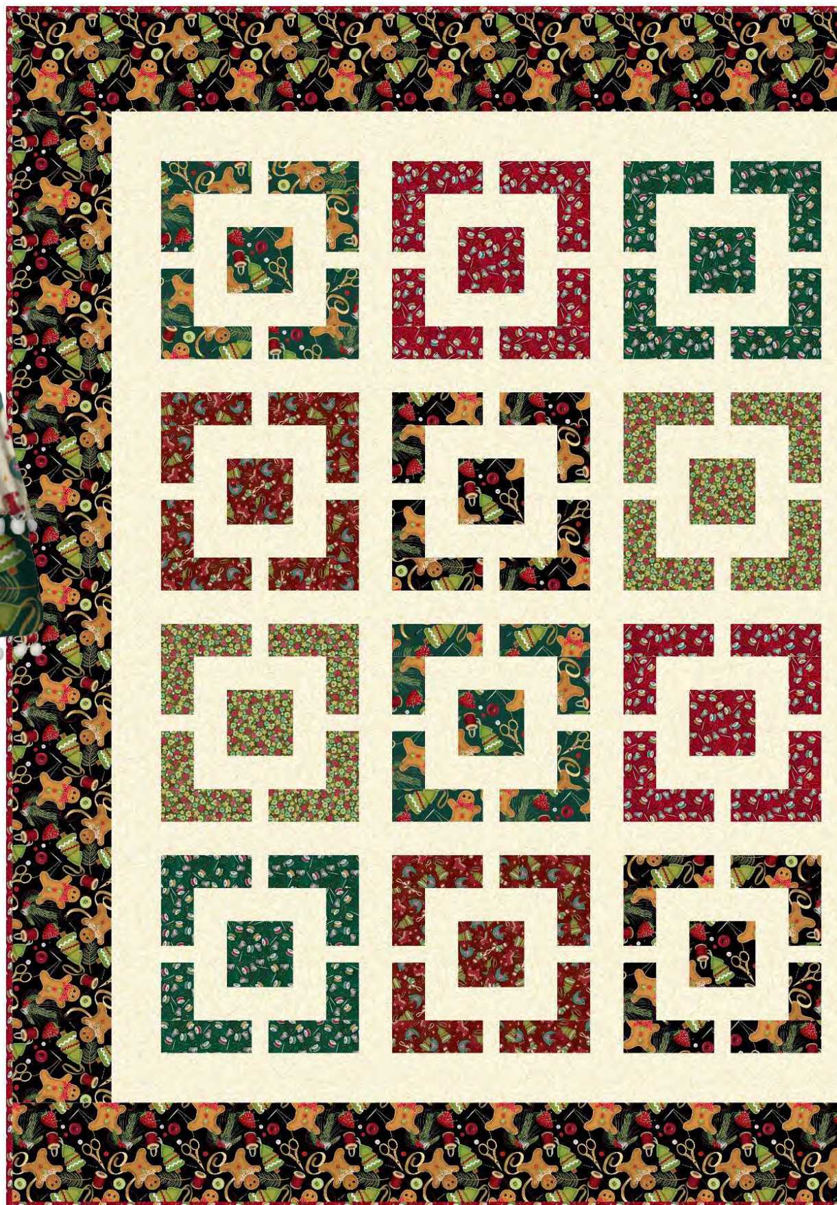
Swirly Girls Design Pattern: Chatterbox 58"x72"