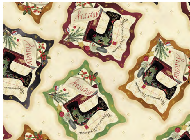
28907 E Sewing Machine Patches (24")