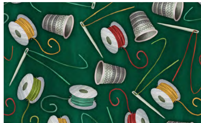
28910 F Thimbles (4.8")