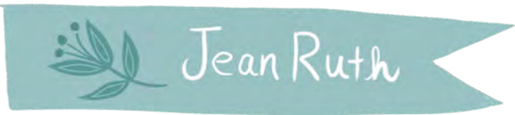
Inspired by CKC Robyns Ruffle Pattern