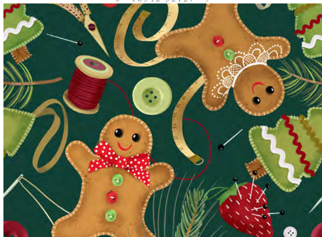
28908 F Sewing & Christmas Toss (6")