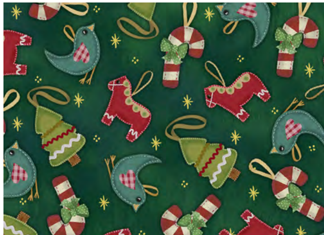
28909 F Ornaments (8")