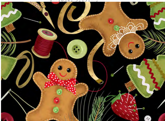
28908 J Sewing & Christmas Toss (6")