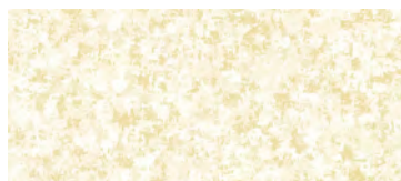
23528 EA Color Blends