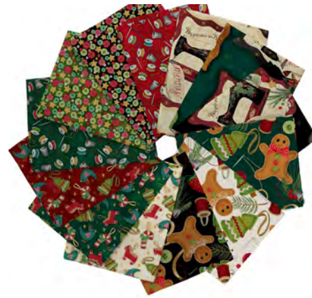
(13) Fat Quarters FATQUAR HAPP 3PKX