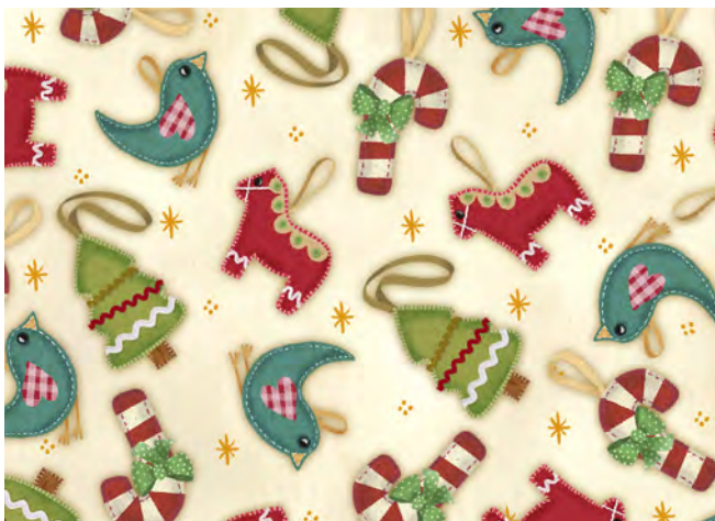
28909 E Ornaments (8")