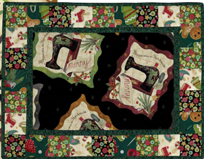
QT Fabrics Free Pattern: Dinner's Ready Apron & Placemat