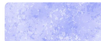
27935 WZ Rapture