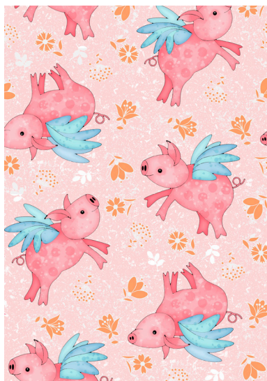
30074 P Flying Pigs Toss