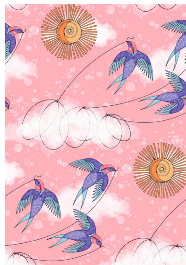
30075 P Birds & Clouds