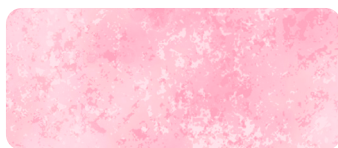
27935 PC Rapture