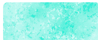
27935 QU Rapture