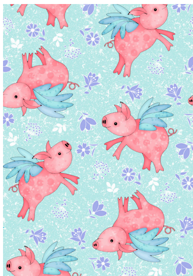
30074 Q Flying Pigs Toss