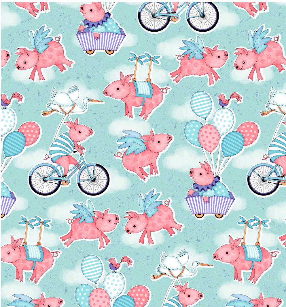
30073 Q Flying Pigs & Bicycles