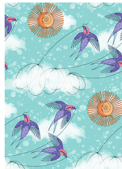
30075 Q Birds & Clouds