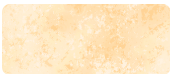
27935 CZ Rapture