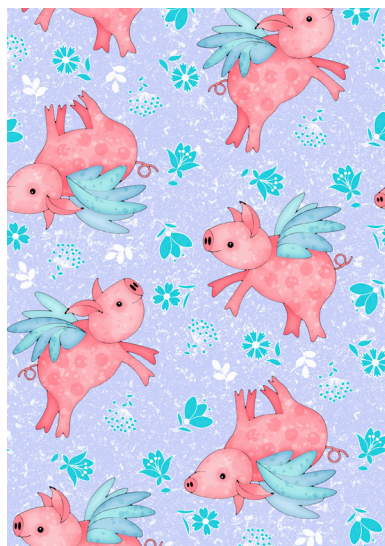
30074 L Flying Pigs Toss