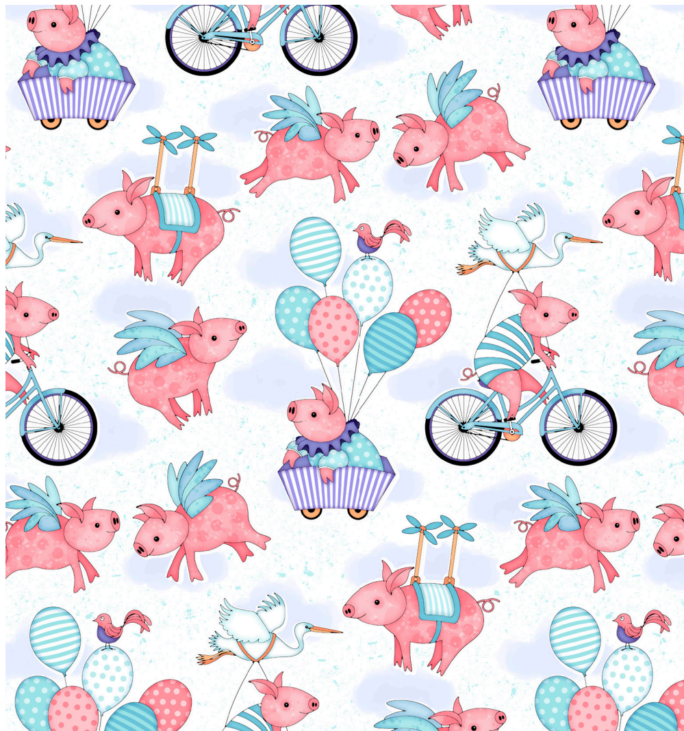
30073 Z Flying Pigs & Bicycles