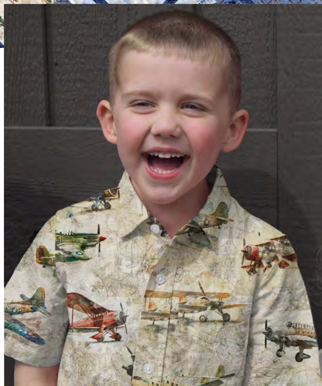
Fishsticks Pattern: The Everyday Camp Shirt -

QT Free REMIX Pattern: Flying High MultiWindow