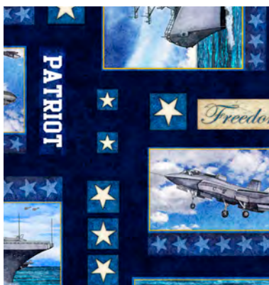
30934 N Navy Patch