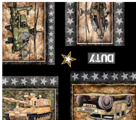
30933 J Army Patch