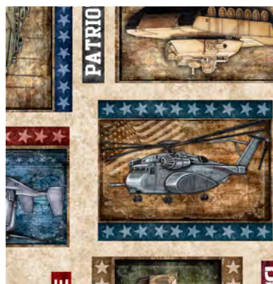
30935 A Marines Patch