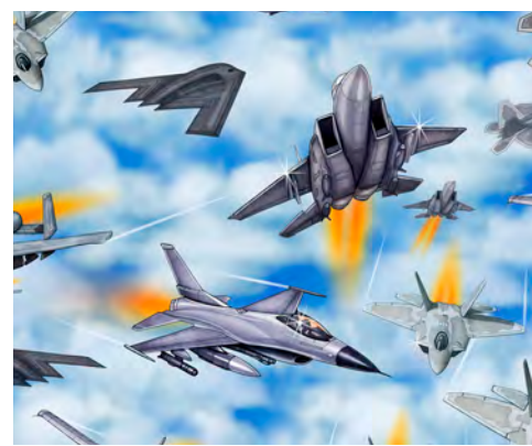
30932 B Fighter Jets