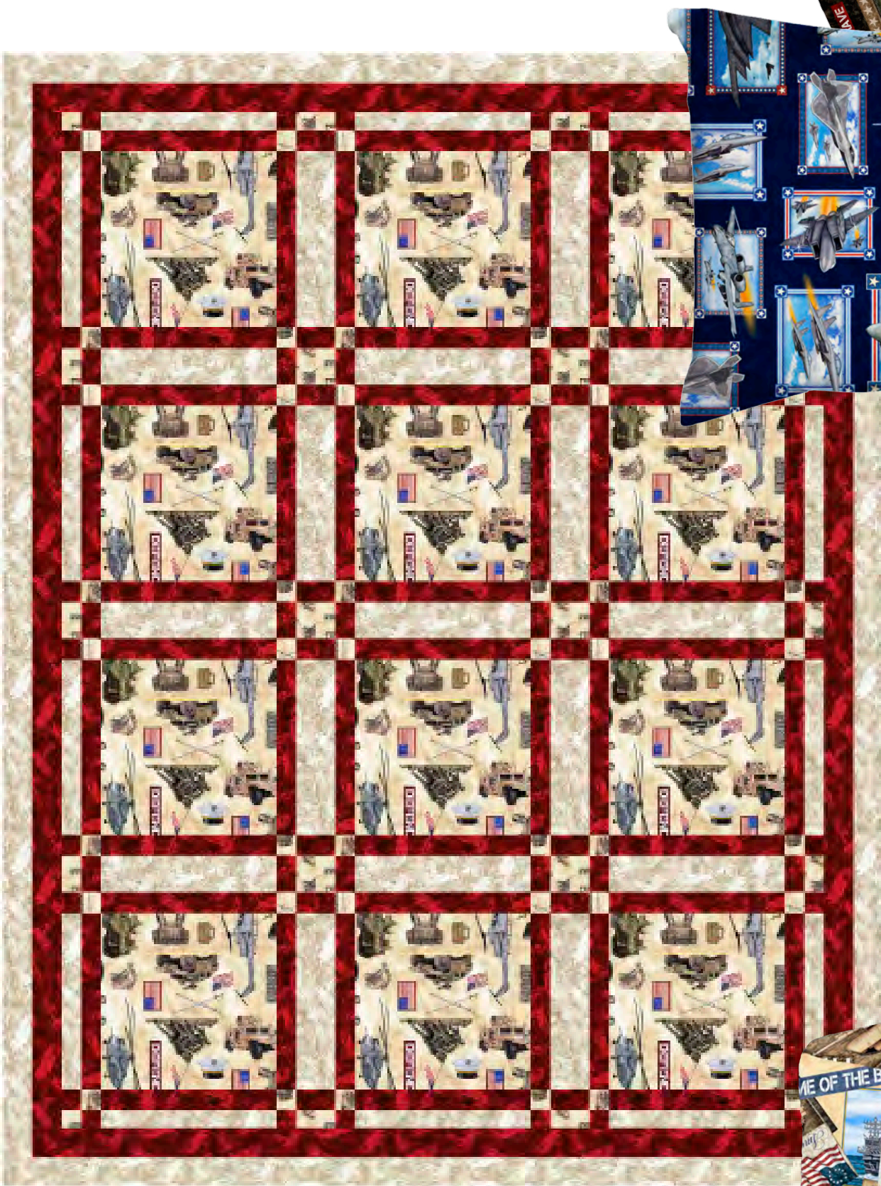
Fabric Cafe Pattern: United Quilt (Single pattern available from Fabriccafe.com )