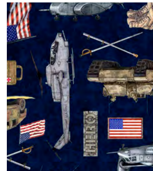
30939 N Marines Allover