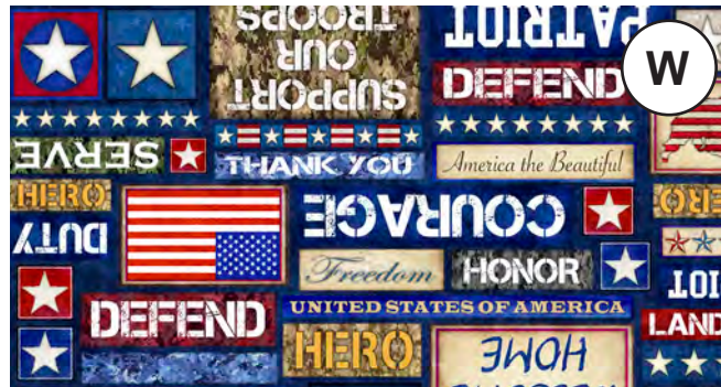
30938 X Patriot Text