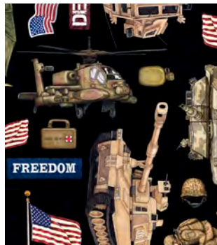
30937 J Army Allover