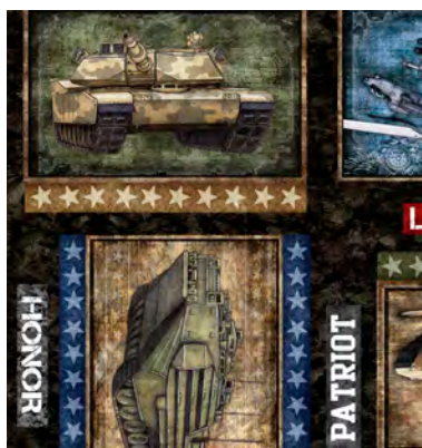
30935 J Marines Patch