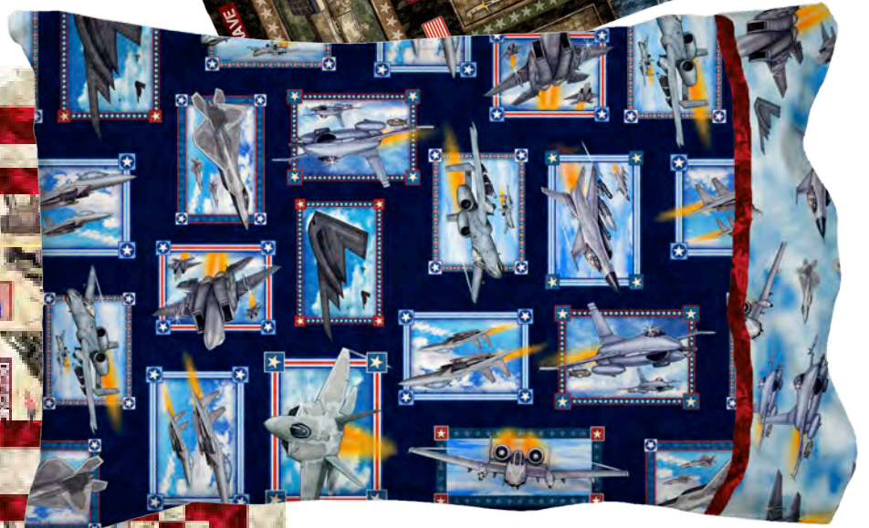
By Annie Pattern: Get Out of Town 2.1

#PBA227.2 GETOUTOFTOWN2.1 FORSALE PATTRN 8002 1