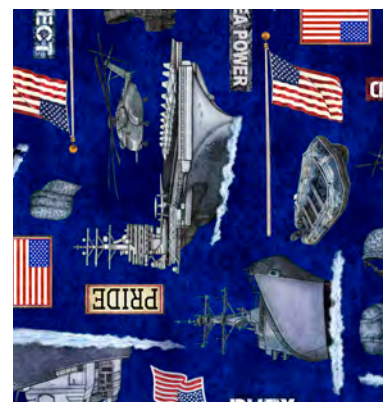
30936 N Navy Allover