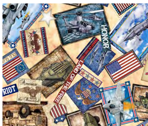
30930 A Military Collage