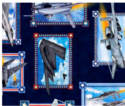
30931 N Airforce Patch