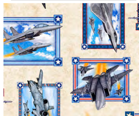
30931 E Airforce Patch