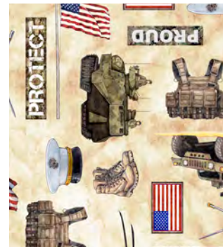
30939 A Marines Allover