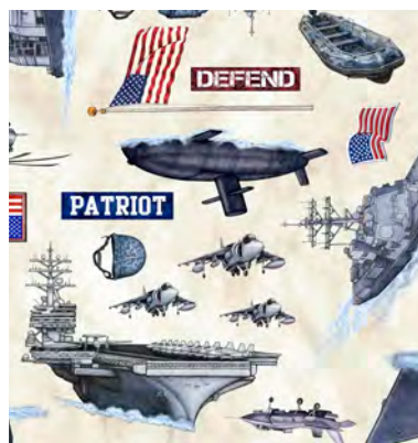
30936 E Navy Allover