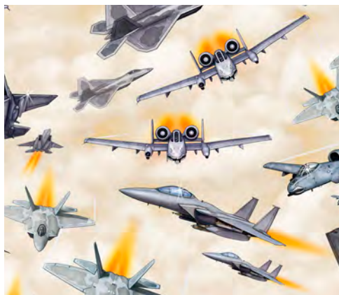
30932 E Fighter Jets