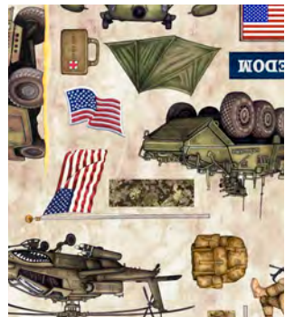
30937 A Army Allover