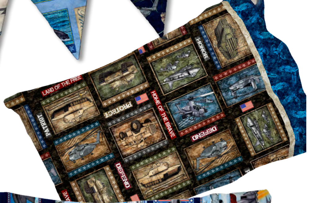
QT Free REMIX Pattern: Perfect Pillowcases