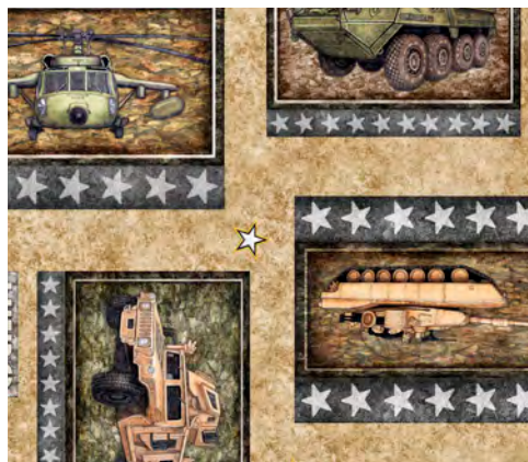
30933 A Army Patch