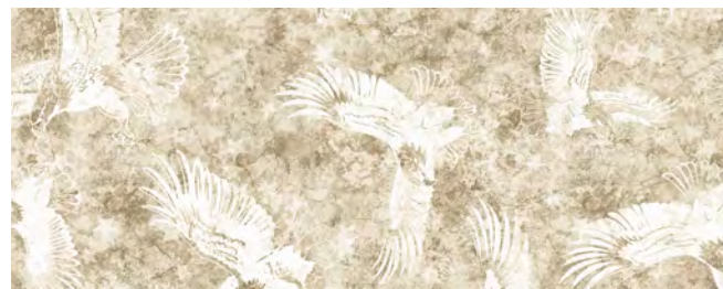
30940 A Eagle Tonal