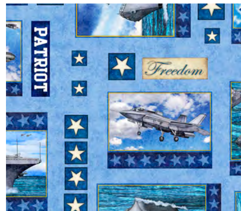
30934 B Navy Patch