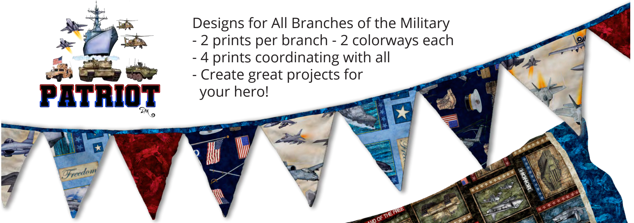
QT Free REMIX Pattern: Pop Up Party Bunting (available at QTFabrics.com when fabric ships)

Designs for All Branches of the Military - 2 prints per branch - 2 colorways each - 4 prints coordinating with all - Create great projects for your hero!