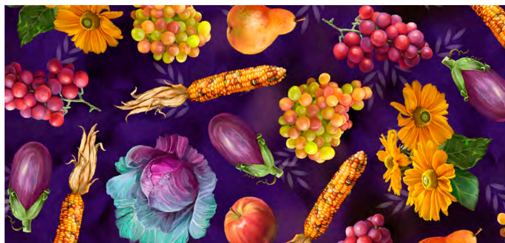
31026 V Harvest Fruits & Floral