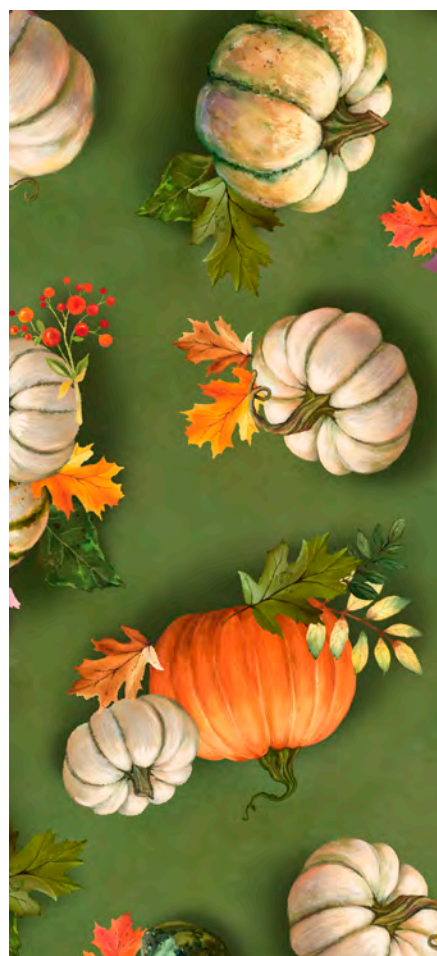
31025 G Pumpkin Toss