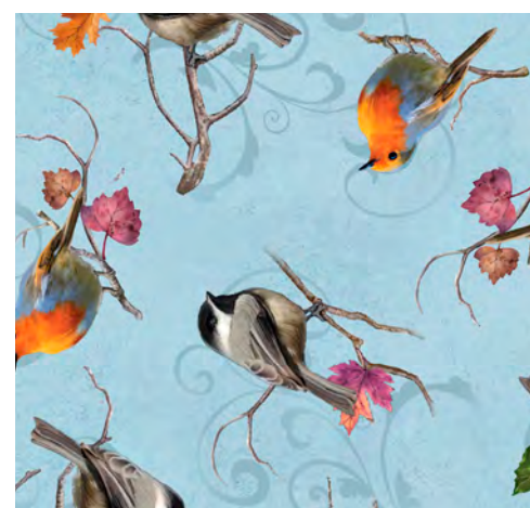
31027 B Birds