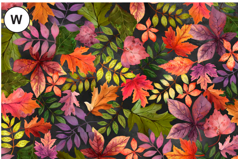
31028 X Fall Foliage