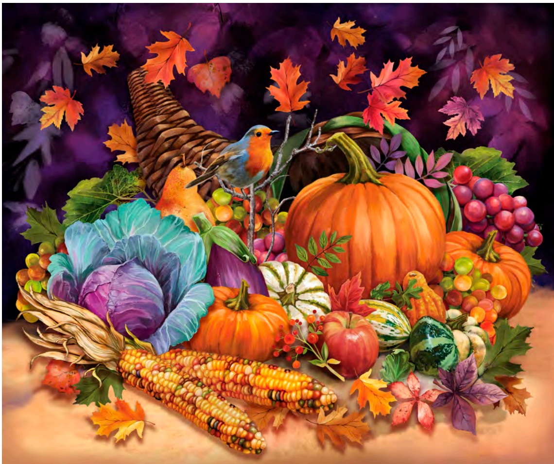
31024 X Harvest Panel (36")