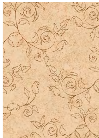
31030 A Delicate Scroll