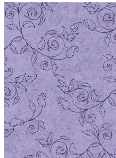
31030 L Delicate Scroll