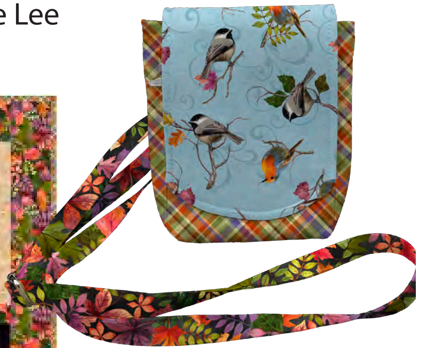
Around The Bobbin Pattern: Zip & Clip Bag

#ATB144, ZIP & CLIP BAG FORSALE PATTRN 8013 R