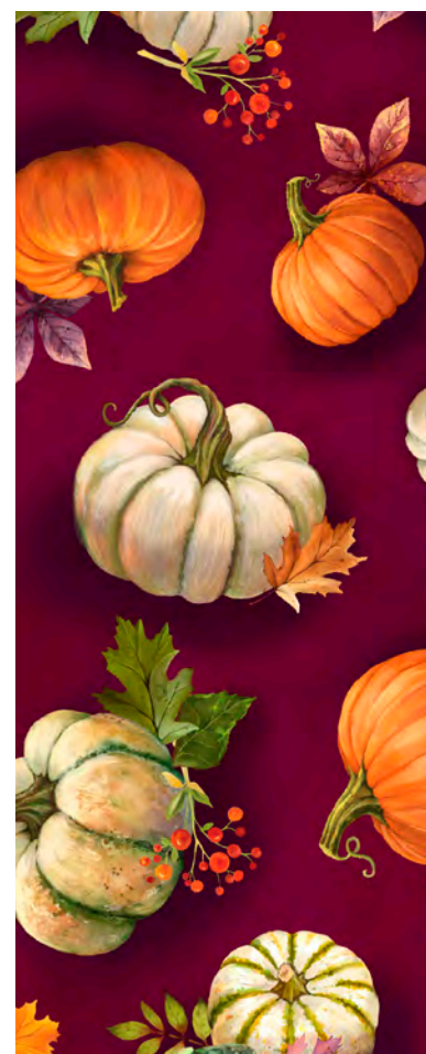
31025 M Pumpkin Toss