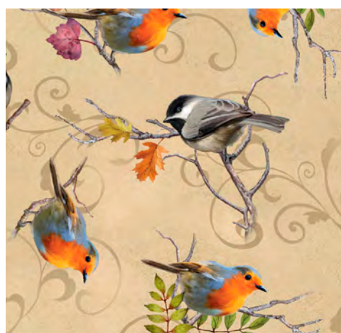
31027 A Birds