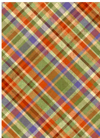
31029 X Diagonal Plaid