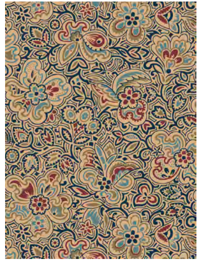
24540 N Small Floral