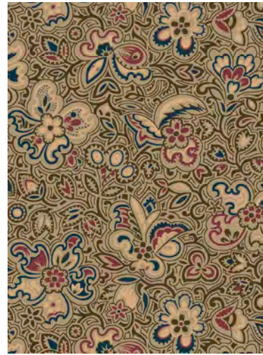
24540 G Small Floral