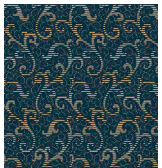
24542 N Windsor Scroll