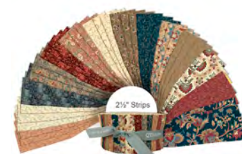
(42) 2 1/2" STRIPS STRIP CNAR 6PKX