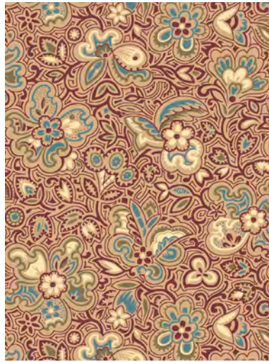
24540 M Small Floral