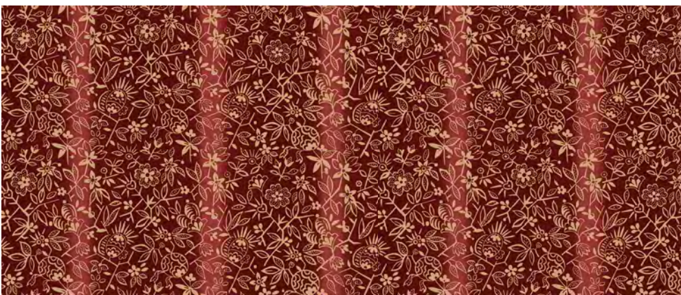
24541 M Floral Ombre stripe (vertical)