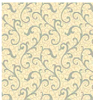
24542 EB Windsor Scroll