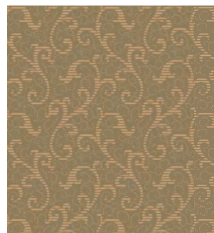
24542 G Windsor Scroll