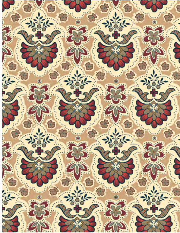
24539 A Foulard Medallion