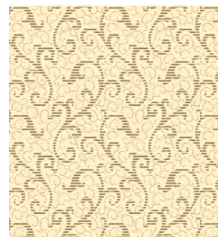
24542 EG Windsor Scroll