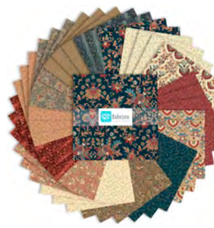
(42) 10" Squares 10SQ CNAR 6PKT