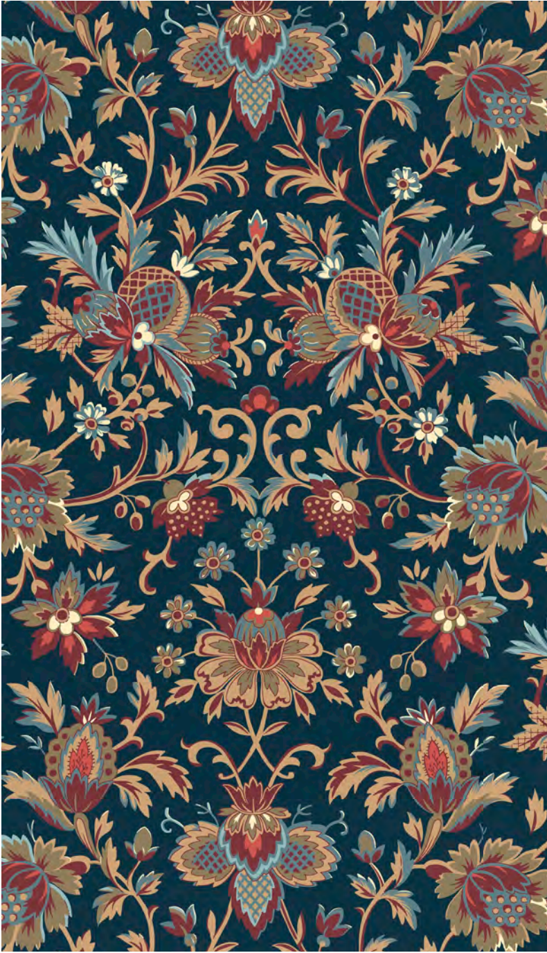
24538 N Jacobean