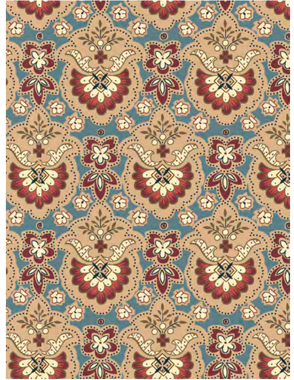
24539 B Foulard Medallion