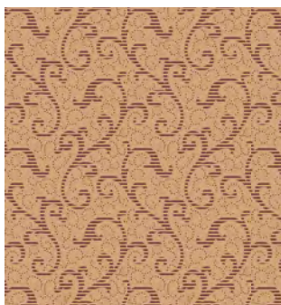
24542 A Windsor Scroll