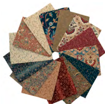
(14) Fat Quarters FATQU CNAR 3PKT